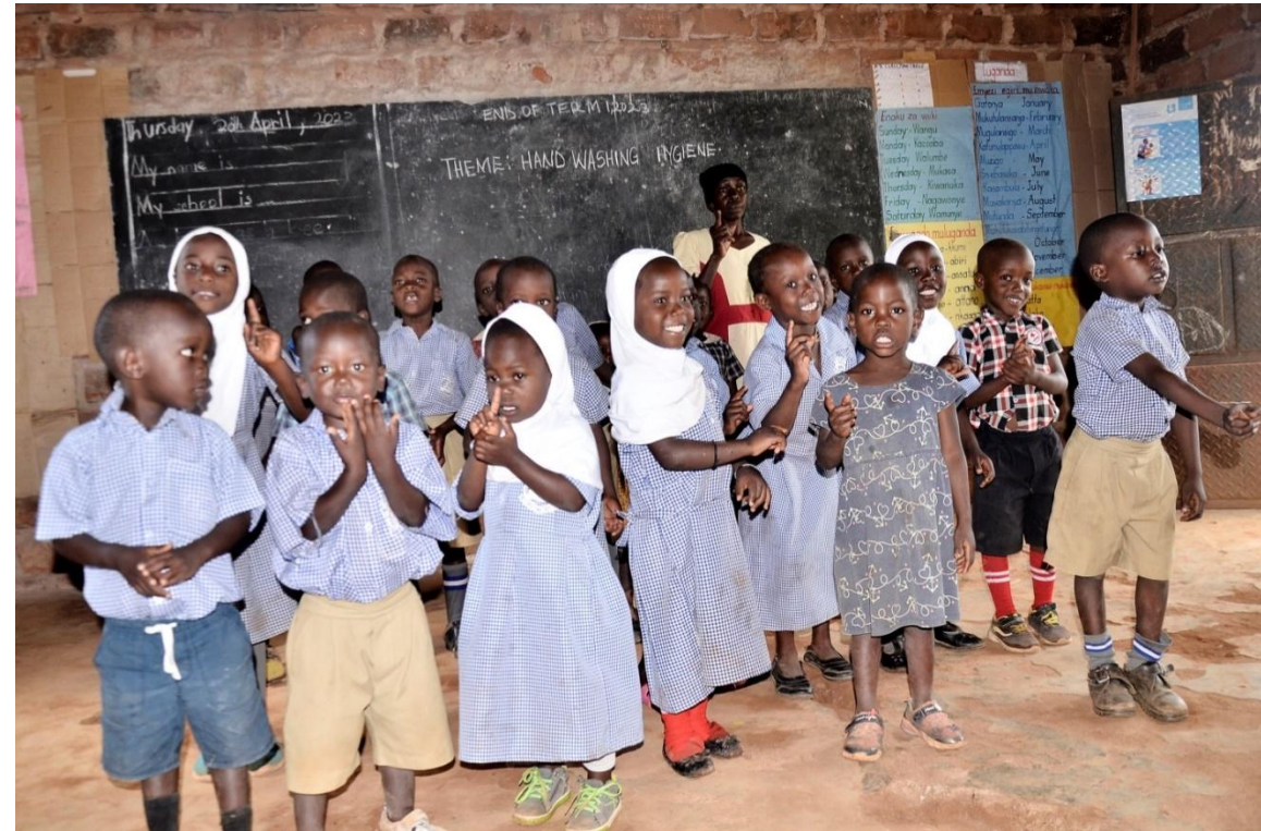
Buso preschool children presenting a poem on washing hands to control diseases like cholera and diarrhea.