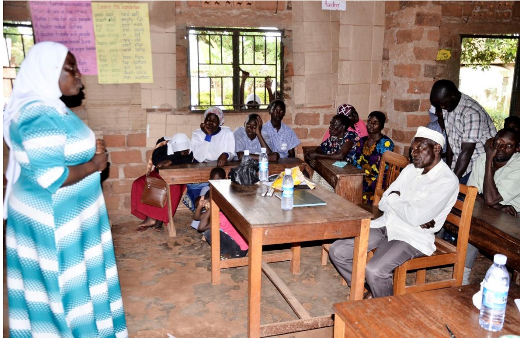
Buso primary school head teacher urges children to participate in activities that address hand hygiene issues in their community