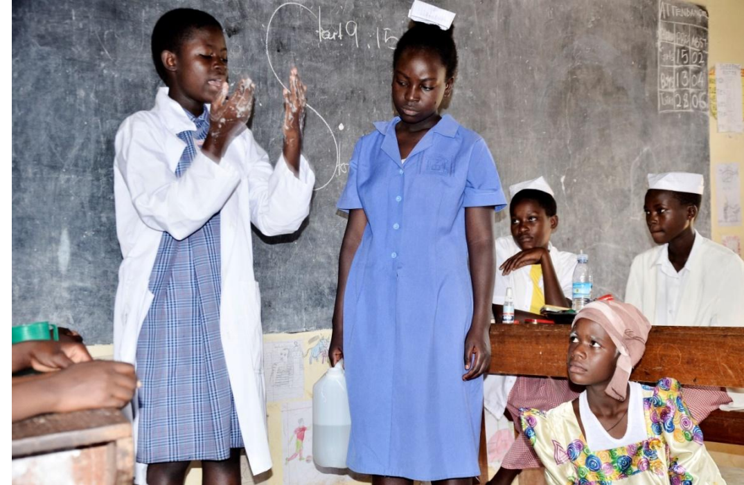
Pupils at Nabagereka primary school present a drama on proper hand washing behaviors