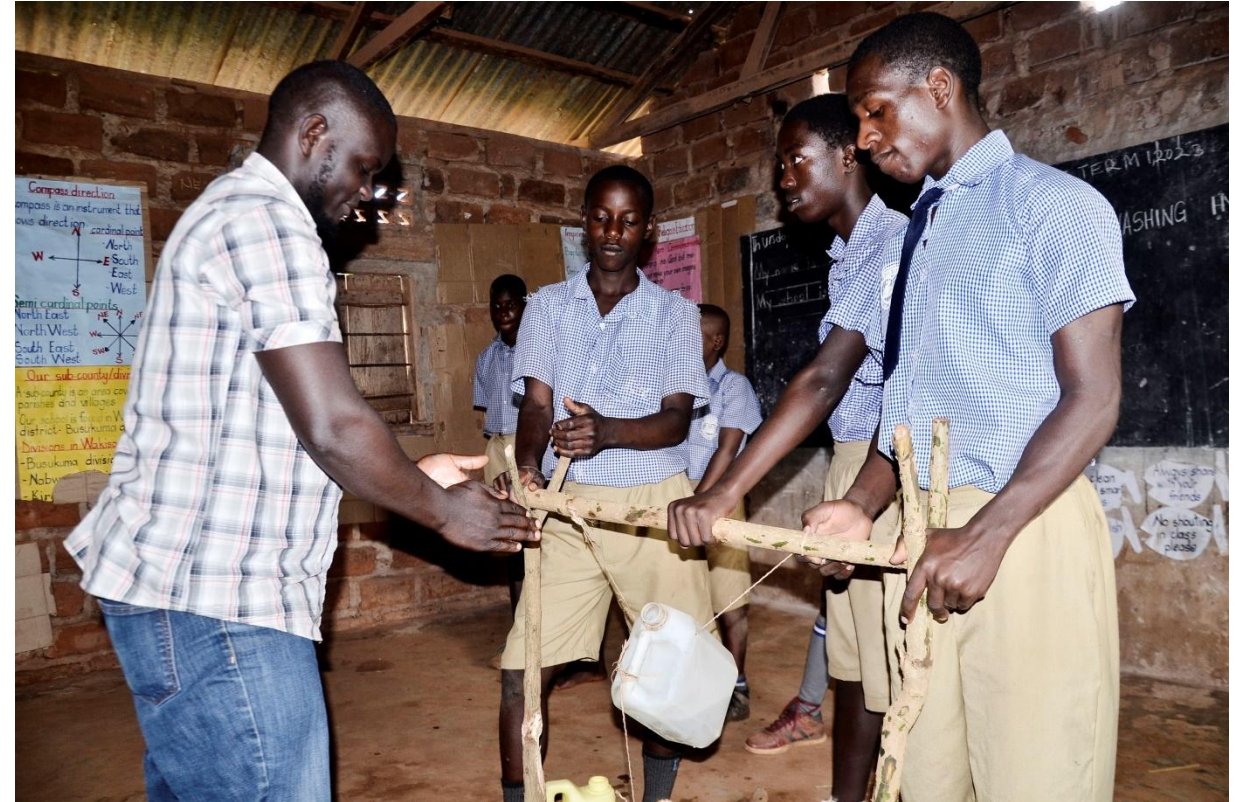
The Buso primary school parent demonstrates the 7 steps of hand washing