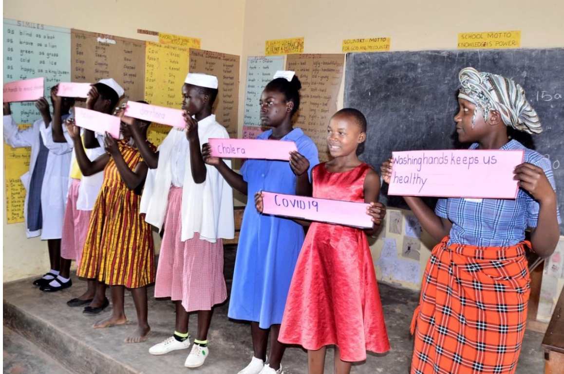
Pupils of Damalie Nabagereka primary school pointing out diseases like cholera, COVID 19 among others that arise from not washing hands

COMMUNITY HEALTH AND INFORMATION NETWORK (CHAIN)